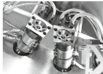
Second material processing and discharge unit