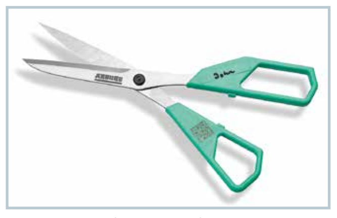
Fig. 9. A generative production step is used to customize mass-produced items, for example through the application of three-dimensional lettering on a scissors handle

code is then applied by laser and individual lettering is added. The linear robotic system places the scissors in workpiece carriers, which are moved out of the injection molding cell on a conveyor belt. Then a 3-D lettering in plastic is applied in a generative process. A mobile robot handles the automatic loading and unloading of the Freeformer for generative production and finally hands the finished products over to the visitors.