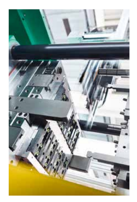
Fig. 4. For highspeed applications, a linear robotic system with a fastaction mold-entry axis may be a better option than a specially designed automation solution

The main products are 30 mm thick lenses with a diameter of around 80 mm. The six-axis robotic system removes these from the mold, places them in a turning station and positions them appropriately for the laser station, where the sprue is removed. Finally, it removes the lens and sprue and places both