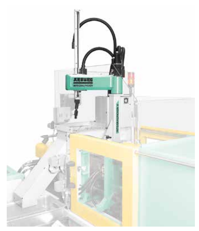
Fig. 3. Practically based solution for short set-up and cycle times: a servo-electrical Integralpicker for removing sprue