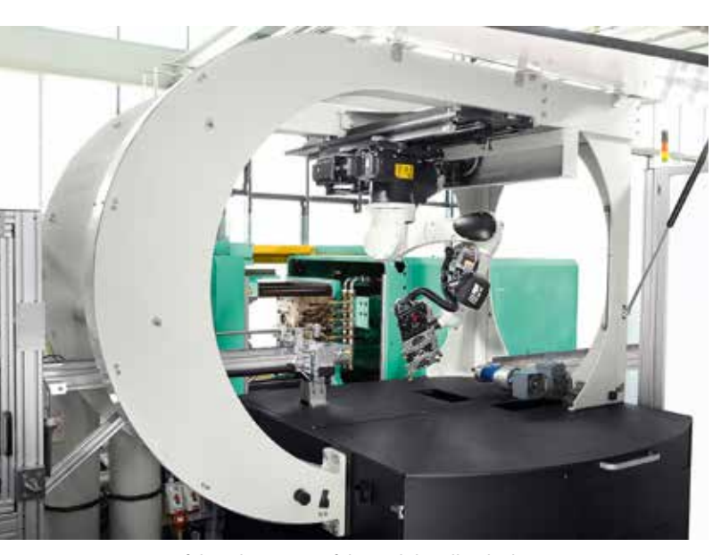
One of the advantages of the mobile cell is the larger operating zone available, as the small six-axis robotic system moves along a seventh linear axis

At present, two automation trends are in evidence among plastics processing companies: On the one hand, the complexity of systems is increasing, while on the other, customers are seeking flexible solutions owing to ever faster product changes, increasing version diversity and, consequently, ever smaller unit volumes per order, down to one-off parts. This means, for example, that high-volume products can be individualized as one-off parts in a flexibly automated, digitally integrated production system by combining injection molding, generative production and "Industry 4.0" technologies.