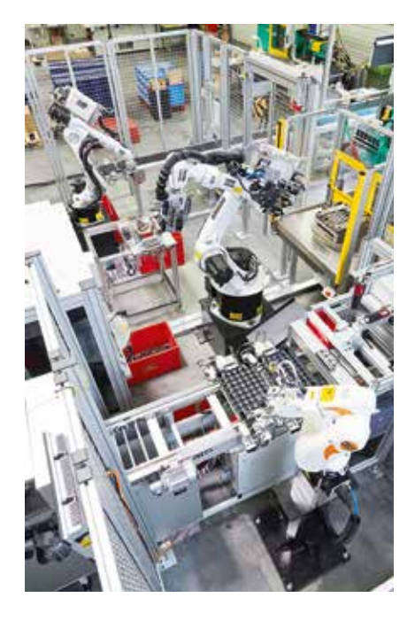
Fig. 6. Synchronized trio: a six-axis robot delivers metal inserts with positional accuracy, the second robot takes the inserts and contacts and places them in the mold, while the third robot is responsible for the inspection of the finished parts by camera

Even though, as the two examples have shown, it is worthwhile investing in complex systems in many cases, the integration of upstream and downstream process steps only makes sense to a certain extent. The limit is reached when the individual processes affect the availability of the system excessively and the required output can no longer be ensured. In these cases, the installation of buffer sections or complete separation of the processes is a better alternative.